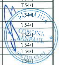
Tabel Parcelar T54